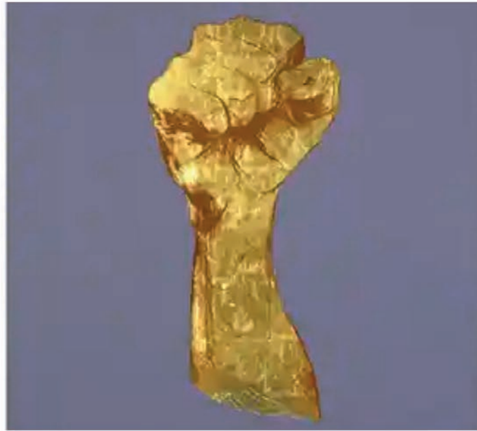
▲ Day 2, one of the works from Nicola Green's In Seven Days ... exhibition about Barack Obama's presidential campaign at the Walker art gallery in Liverpool. Photograph: Nicola Green

Liverpool show reveals British artist Nicola Green's exploration of the 2008 US presidential campaign