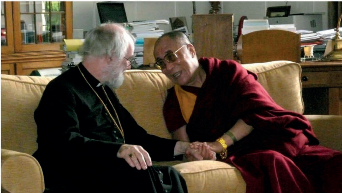
Rowan Williams, then the archbishop of Canterbury, meets the Dalai Lama, 2010